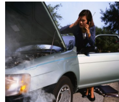
Roadside assistance program